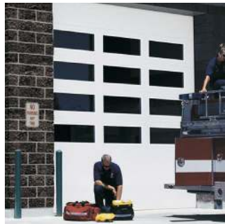
TC Series, TC300

Raynor also offers a full line of sectional, rolling, fire, high performance and traffic doors, as well as, security grilles. See your Raynor Dealer or visit www.raynor.com for more information.