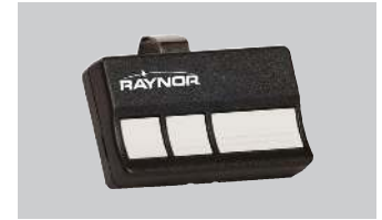
3 Button Transmitter