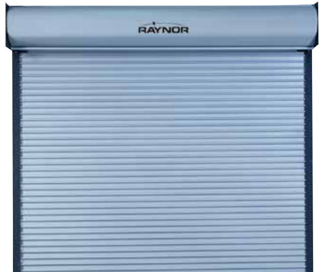
DuraCoil Flat Slat (FF)