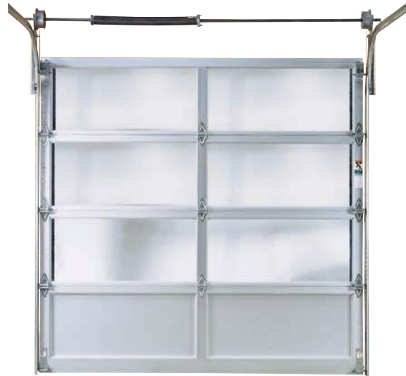
AlumaView AV200 with aluminum bottom panels.

AlumaView doors help you reduce energy costs with a U-shaped, vinyl bottom weatherseal secured by a sturdy aluminum retainer.