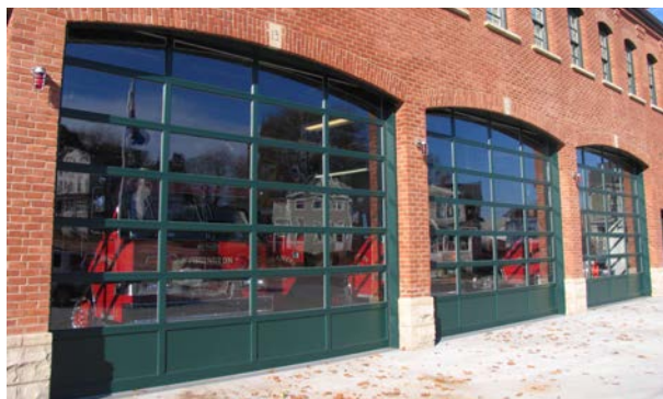
AlumaView AV200, ArmorBrite™ green with aluminum bottom panels.

Choose from six custom anodize finishes including champaign, light bronze, medium bronze, dark bronze, extra dark bronze, or black.